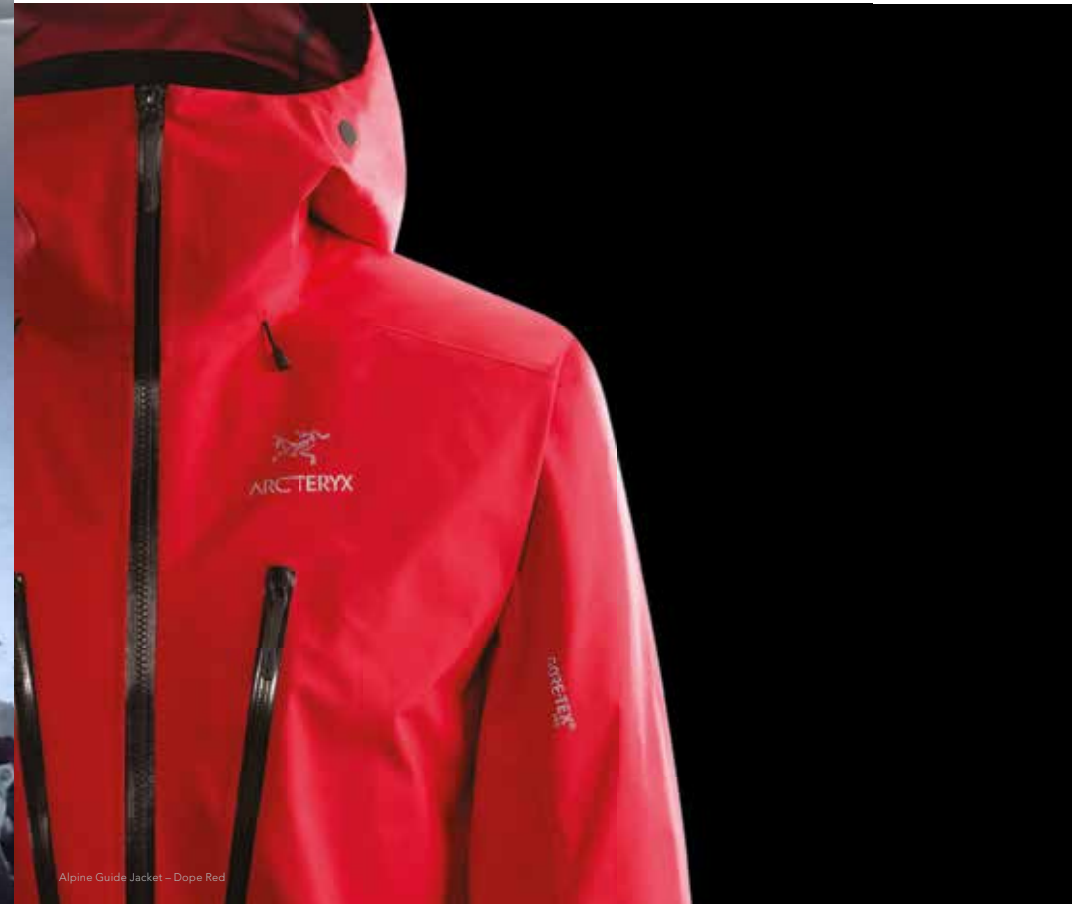
Alpine Guide Jacket - Dope Red