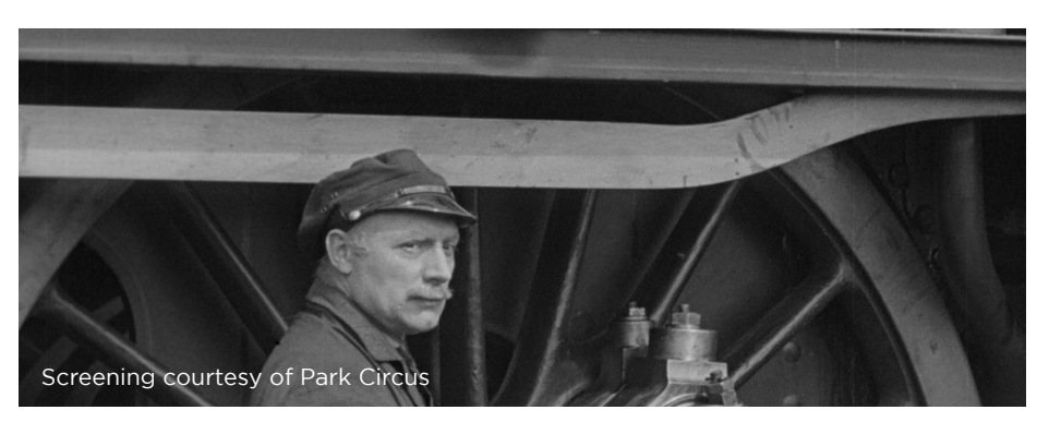
Saturday 23 March | Doors/food served 18:30 | Screening 19:30 - 20:45 £25/£22.50 conc.

incl. hot main meal (vegan option available), side salad, cake and hot drink. Pre-book by 15 March to secure your dietary choice (after that date, vegan option only).