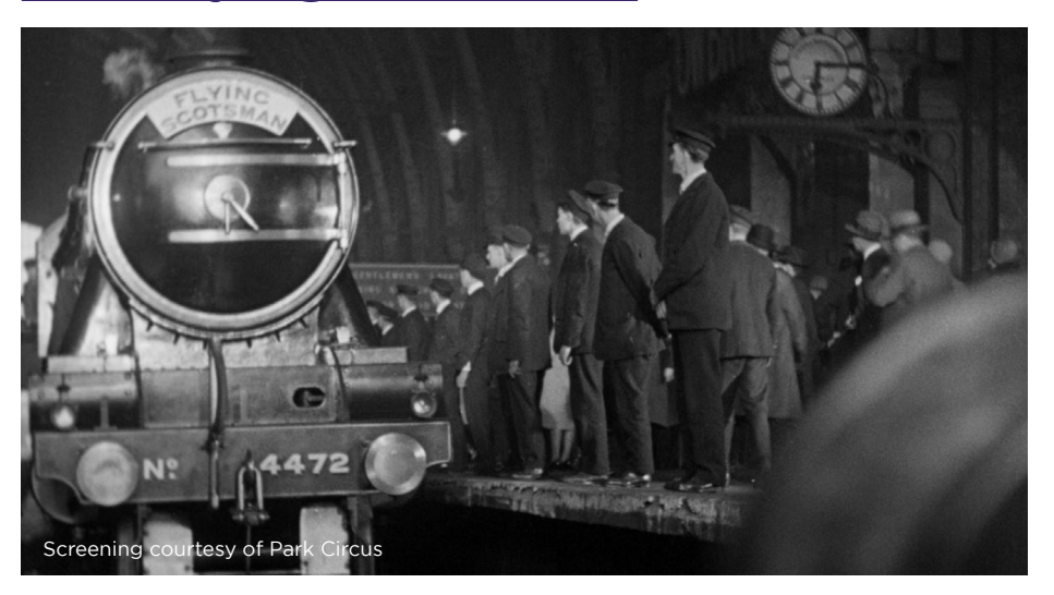
Saturday 16 March | 19:30 | £10/£8 conc. Venue: Barony Theatre, Borrowstoun Rd. EH51 9RS

Rare screening of the original, fully silent version of this cracking nail-biter, filmed on board the most iconic train in British railway history.