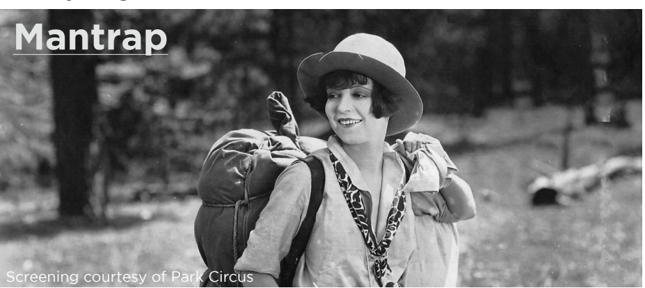
Friday 22 March | 20:00 (reception & doors from 19.00) | £22/£19 conc. INCLUDING 'CHAMPAGNE' RECEPTION AND AFTER PARTY