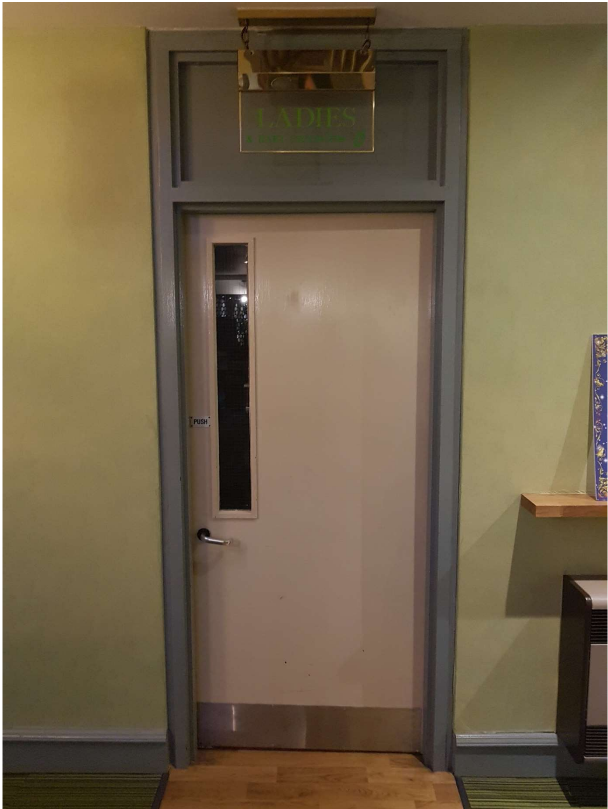
The ladies' toilet and the baby change area downstairs are through this door