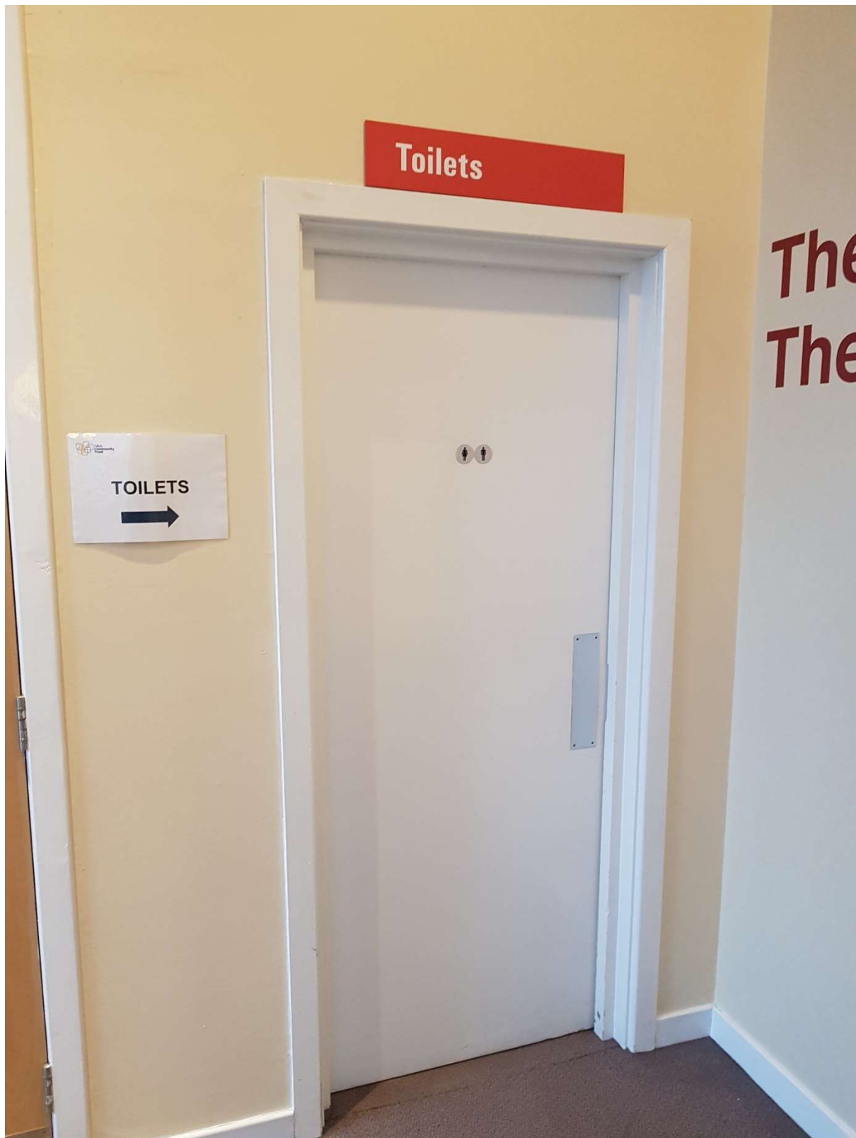
Through this door on the first floor are the ladies and gents toilets.