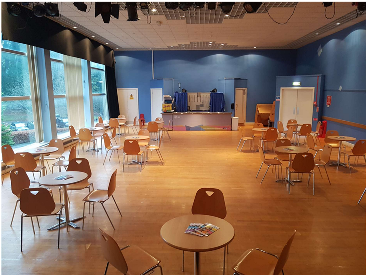
The studio space which will be the quiet zone

The 'Quiet Zone' will be upstairs in our studio theatre space if you need to take a break from the performance for any reason. We will have relaxed lighting, chairs, tables and a live feed of the show on a screen. To access the room you can go up the staircase or via our lift which is to the left hand side of the entrance doors.