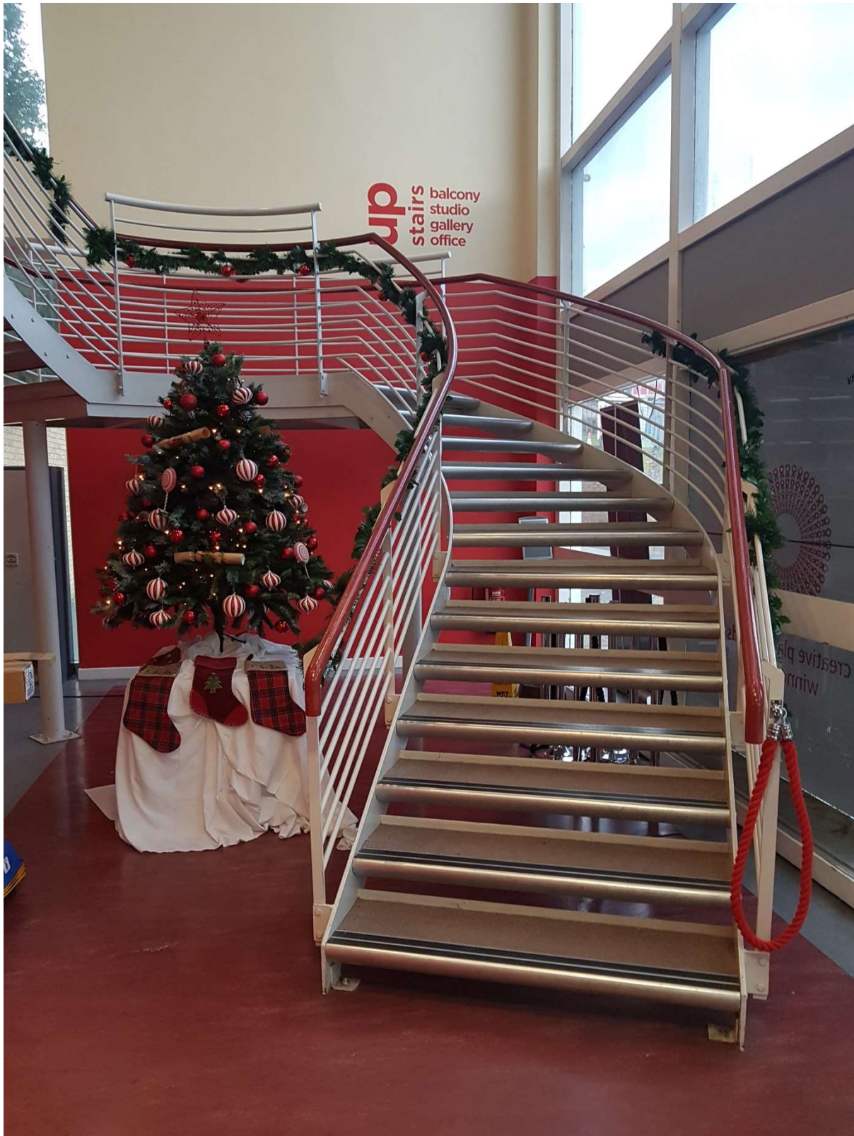
This is the staircase in the main foyer and it leads upstairs to the 'Quiet Zone' in the studio and the balcony