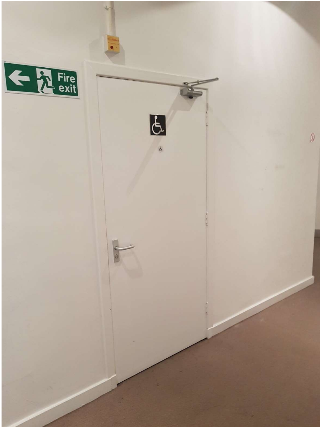
This is the accessible toilet on the first floor.