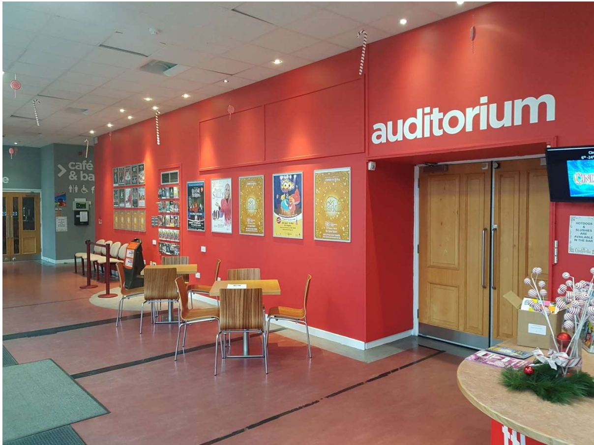
This is the main Foyer in FTH Theatre

There will be hand sanitiser in the foyer for you to use.